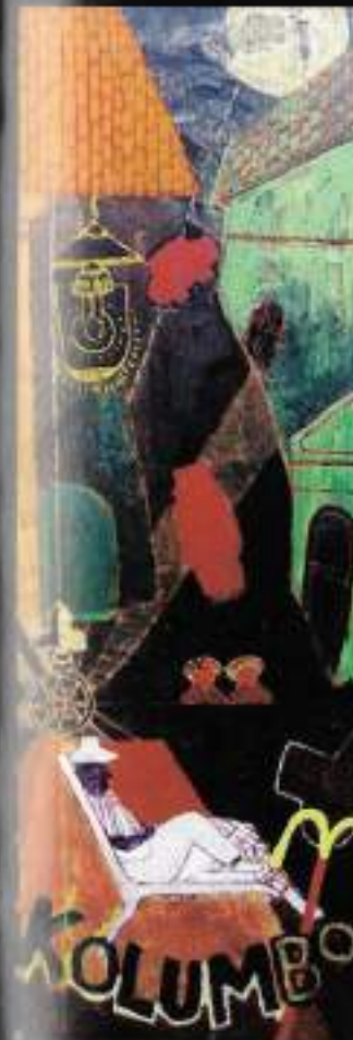
17. COLOMBO OIL ON CANVAS 90X30CM