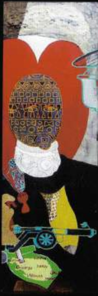
15. HOMIK BASHA OIL ON CANVAS 90X30CM