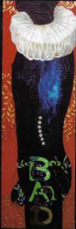
14. NAO OIL ON CANVAS 90X30CM