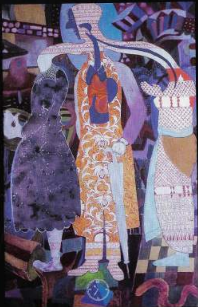
9. CANDY COUSINS OIL ON CANVAS 116X124CM