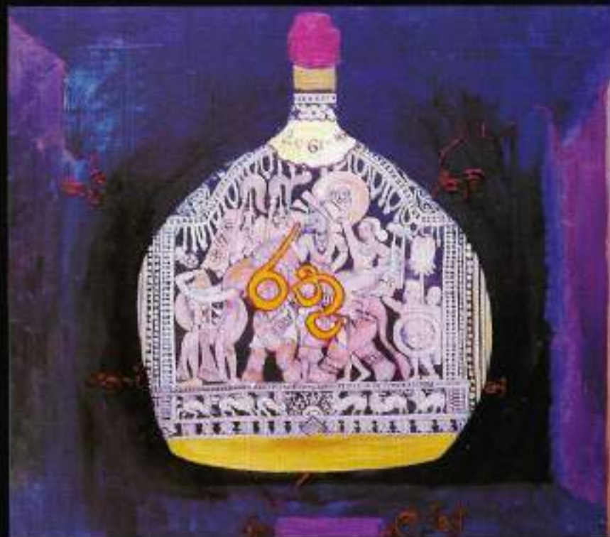
5. RED WINE OIL ON CANVAS 50X40CM