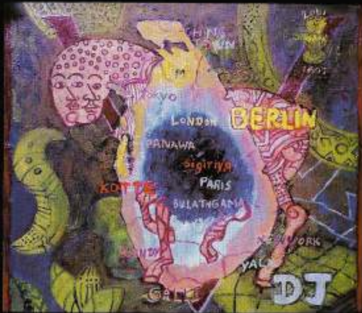
11. HYBRID ISLAND AND DJ OIL ON CANVAS 10X50CM