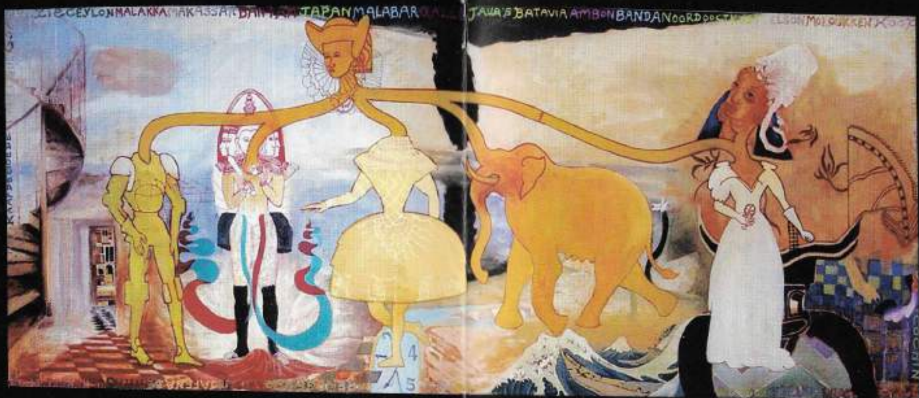
8. THE PATH OF YOUR JOURNEY AND QUEEN VICTORIA OIL ON CANVAS 100x250CM