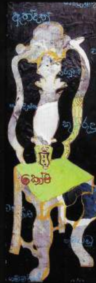
19. OREN CHAR OIL ON CANVAS 90X30CM