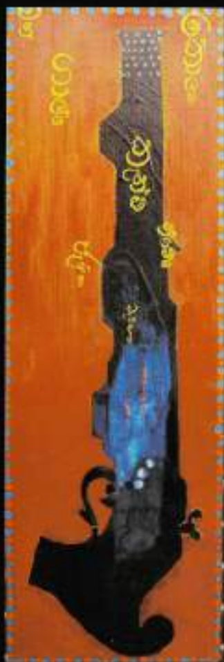
20. THE GUN OIL ON CANVAS 90X60CM