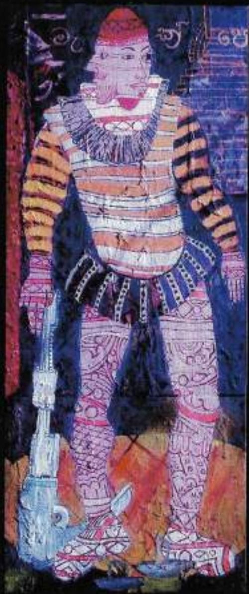
2. THE FIRST SUPERMAN Oil on canvas 16x44cm