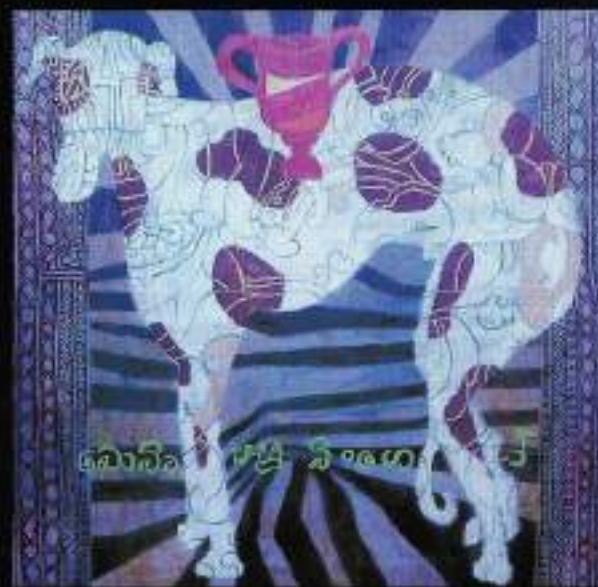
22. SINGO OIL ON CANVAS 70X70CM