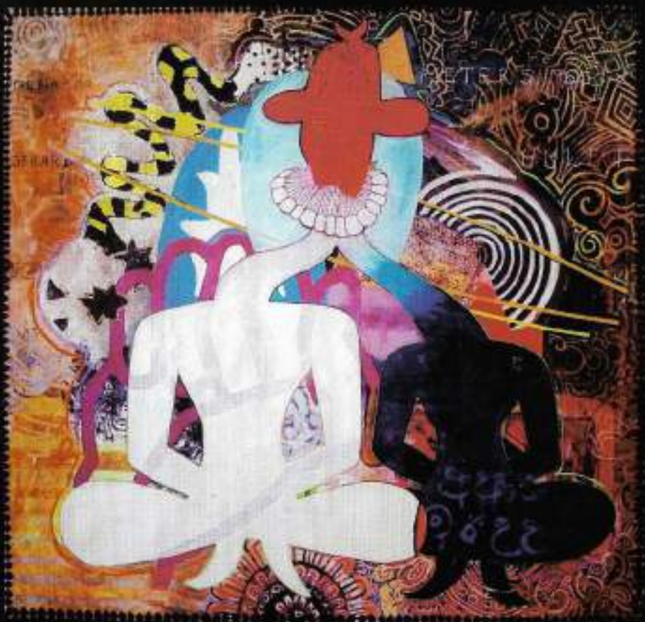
4. HERATH PETER AND 19TH CENTURY PASTICHE OIL ON CANVAS 140X100CM