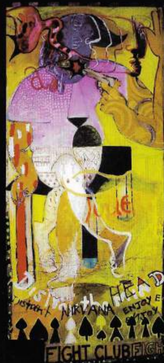
I, ENJOY ENJOY OIL AND ACRYLIC ON CANVAS 150x85CM