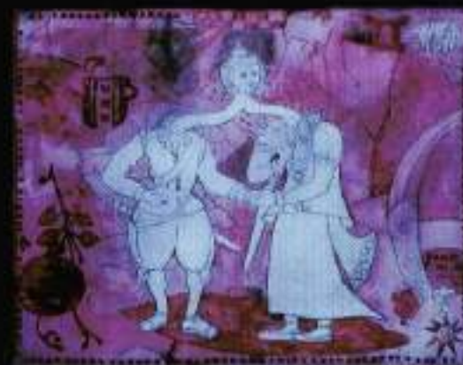
23. KING OF SANDY OIL ON CANVAS 30X30CM