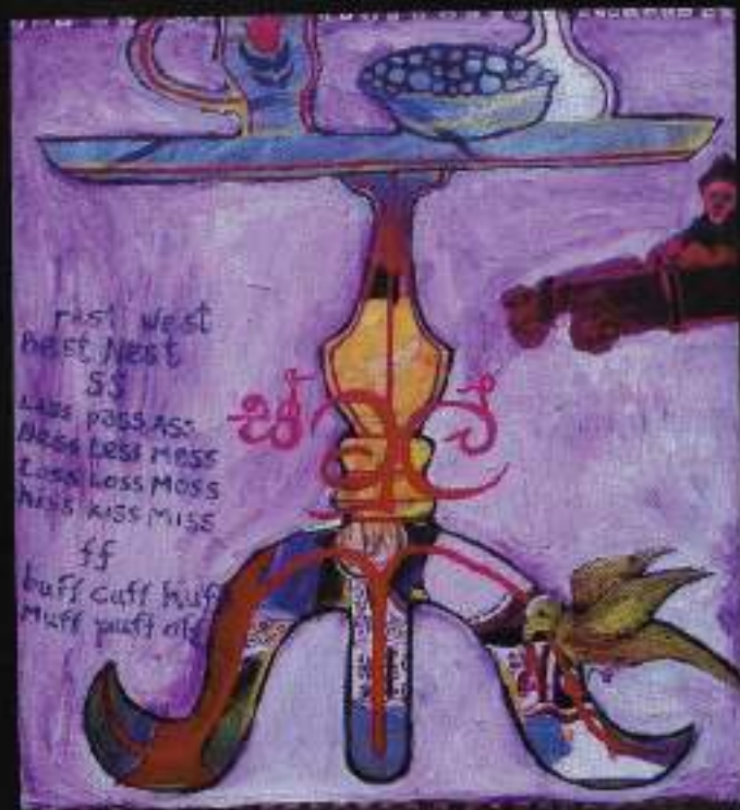
10. STOOL OIL ON CANVAS 66X60CM