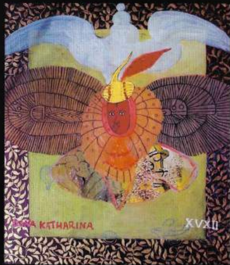
3. DONA KATHARINA Oil on canvas 68x73cm