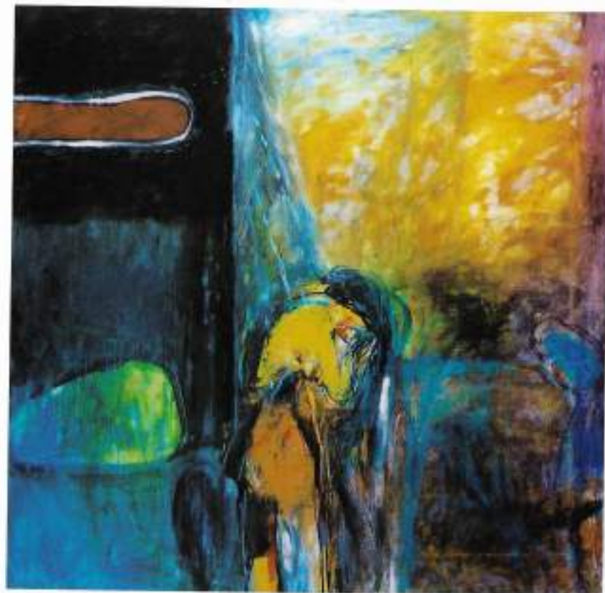
3. BATH III ACRYLIC ON CANVAS 152X145CM