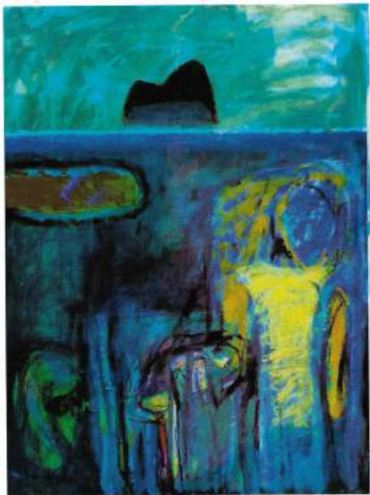
6. BATH VI ACRYLIC ON CANVAS 122X91CM