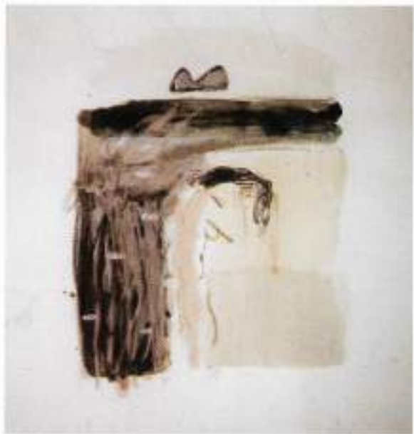
12. BATH XII INK, CHARCOAL+GOUACHE ON PAPER 50X50CM