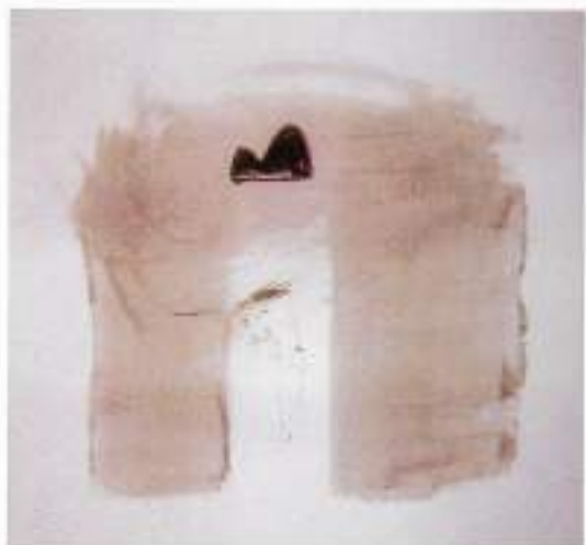
18. BATH XXII INK, CHARCOAL+GOUACHE ON PAPER 56X55CM