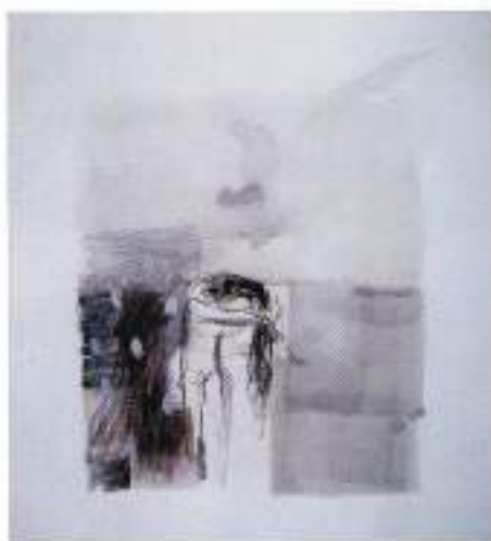
15. BATH XV INK, CHARCOAL+GOUACHE ON PAPER 50X50CM