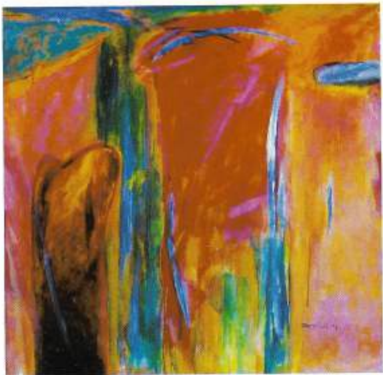
8. BATH VII ACRYLIC ON CANVAS 92X92CM