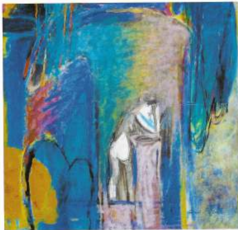
9. BATH IX ACRYLIC ON CANVAS 92X92CM