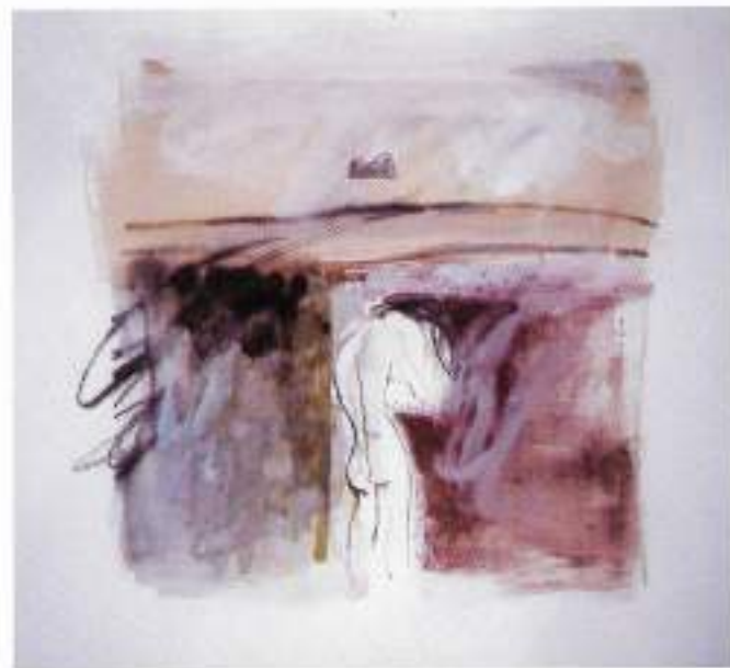
13. BATH XIII INK, CHARCOAL+GOUACHE ON PAPER 56X56CM