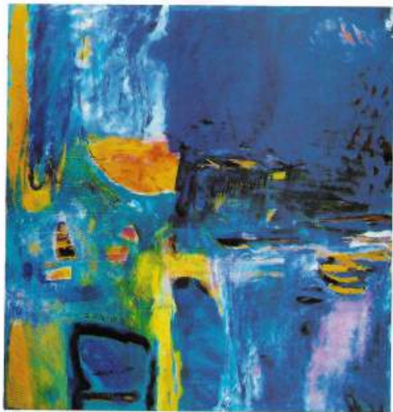
2. BATH II ACRYLIC ON CANVAS 152X145CM