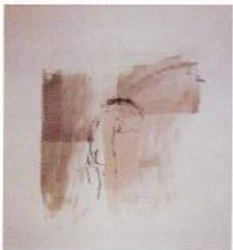
19. BATH XIX INK, CHARCOAL+GOUACHE ON PAPER 45X45CM