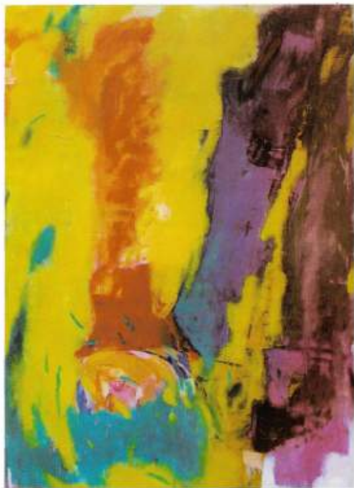
5. BATH V ACRYLIC ON CANVAS 122X91CM