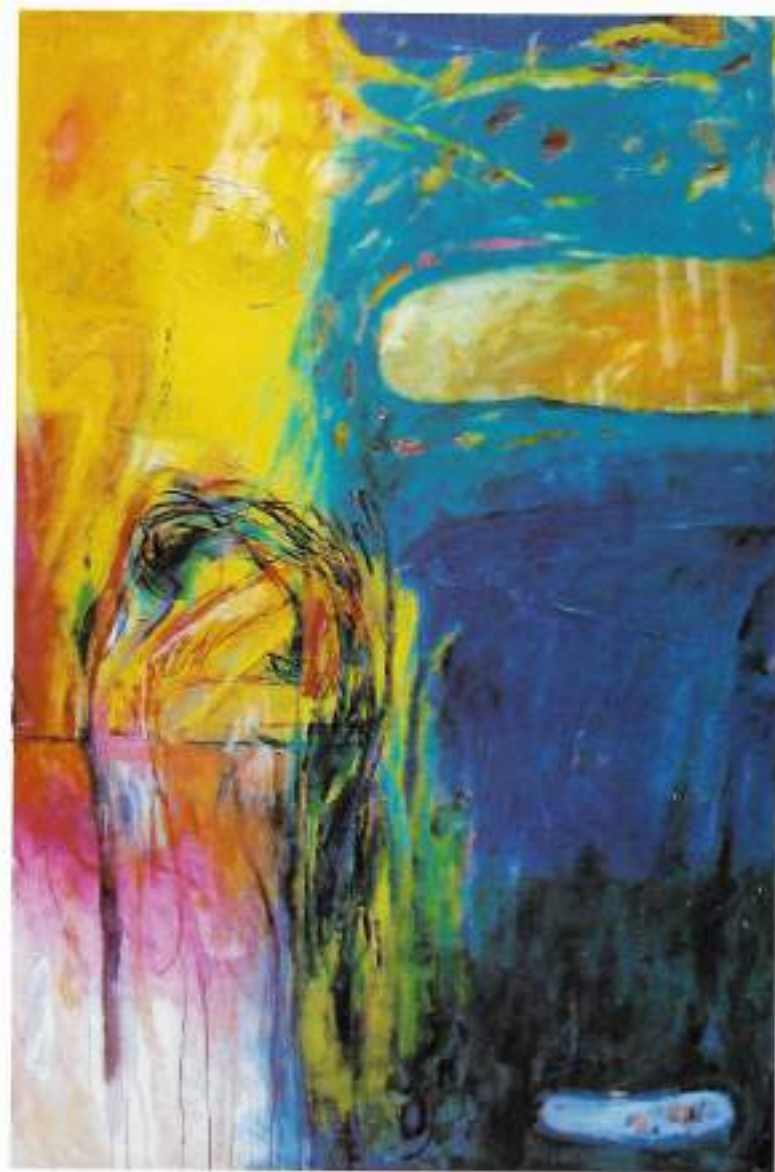
1. BATH I ACRYLIC ON CANVAS 180X120CM