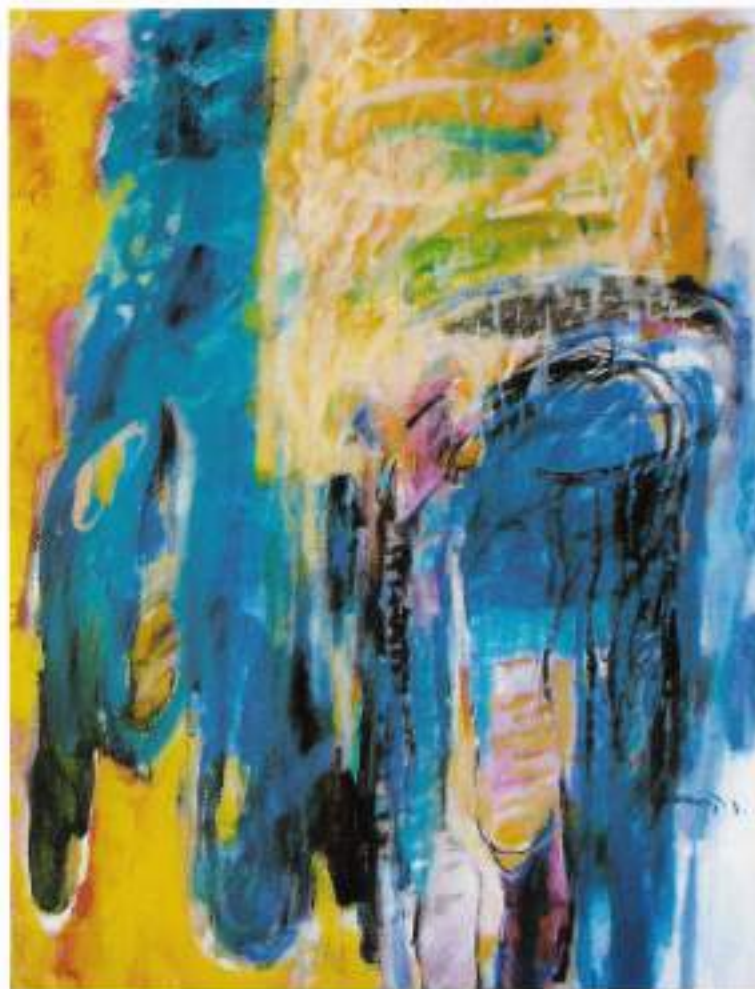
7. BATH VI ACRYLIC ON CANVAS 122X91CM