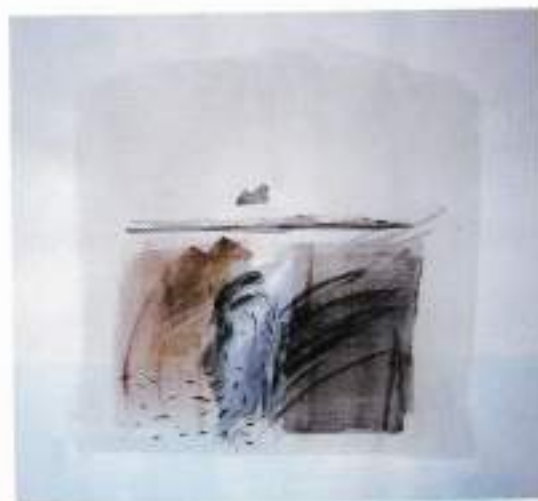
16. BATH XVI INK, CHARCOAL+GOUACHE ON PAPER 56X56CM