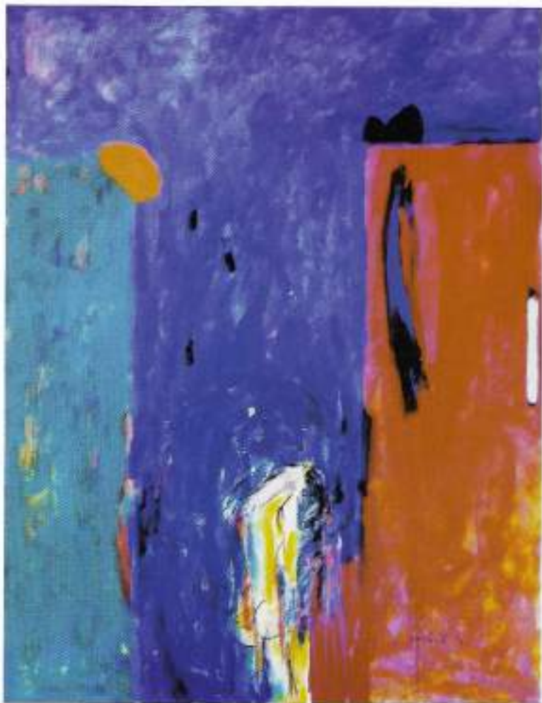
10. BATH X ACRYLIC ON CANVAS 122X91CM