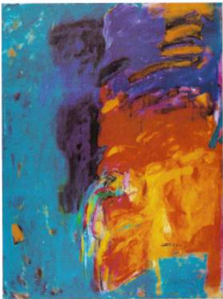
4. BATH IV ACRYLIC ON CANVAS 122X91CM