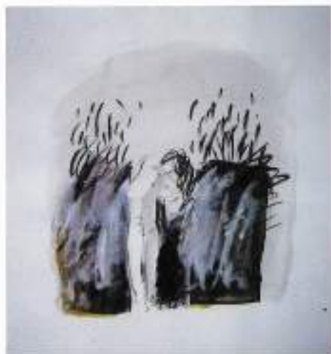
14. BATH XIV INK, CHARCOAL+GOUACHE ON PAPER 56X56CM