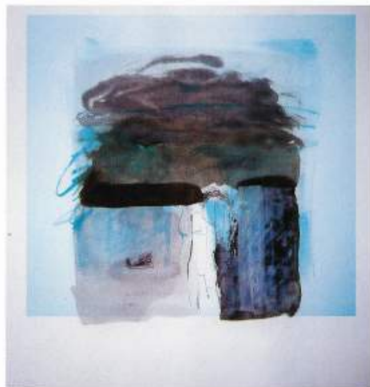
11. BATH XI INK, CHARCOAL+GOUACHE ON PAPER 50X50CM