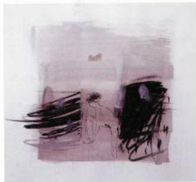
20. BATH XX INK, CHARCOAL+GOUACHE ON PAPER 45X45CM